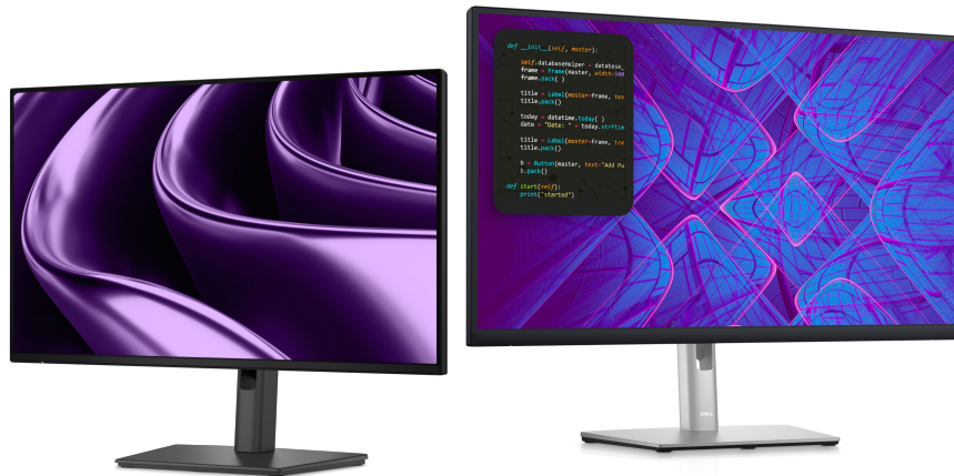
(Left: Dell P2426HE; Right: Dell P2725QE)

Warning: Using external displays with a MacBook